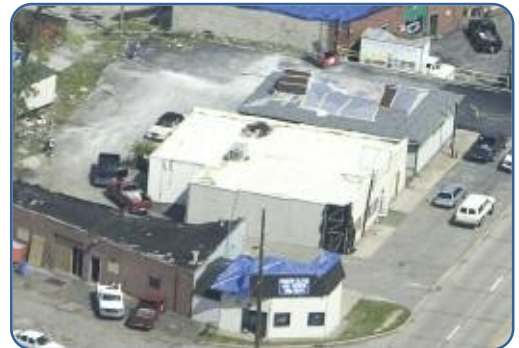
The Duro-Last roofing system protected the Par Printed Forms, Inc. building from Indianapolis, Indiana, tornadoes.

Don't let another storm threaten your building occupants and contents.