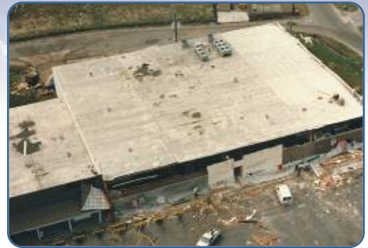
After taking on Hurricane Hugo, the Duro-Last roof on the Charleston, South Carolina, Piggly-Wiggly remained intact.