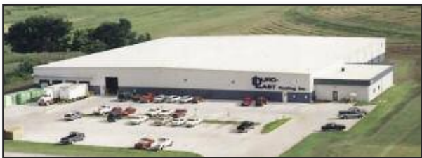
Duro-Last’s Manufacturing Facility in Sigourney, IA

Backed By The Industry’s Best Warranties: Duro-Last is so confident in the durability of our roofing systems that we protect commercial and industrial installations with the best warranties in the industry. Our standard, 15-year No Dollar Limit (NDL) warranty is transferable, has no exclusions for ponding water, and provides coverage against consequential damages that result from defects in the Duro-Last material. Duro-Last also has 20-year warranties available.