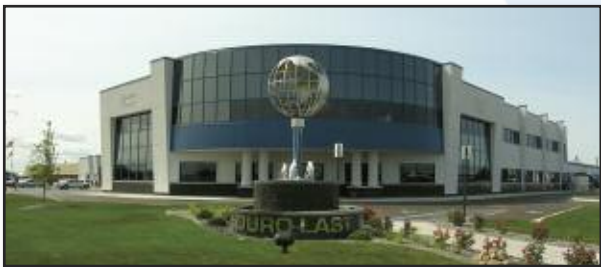
Duro-Last Corporate Headquarters in Saginaw, MI

Backed By The Industry’s Best Warranties: Duro-Last is so confident in the durability of our roofing systems that we protect commercial and industrial installations with the best warranties in the industry. Our standard, 15-year No Dollar Limit (NDL) warranty is transferable, has no exclusions for ponding water, and provides coverage against consequential damages that result from defects in the Duro-Last material. Duro-Last also has 20-year warranties available.