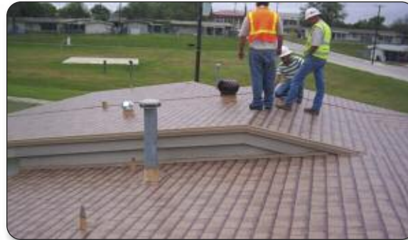
Over 30 years of proven performance and the industry's best warranty ensure peace of mind.