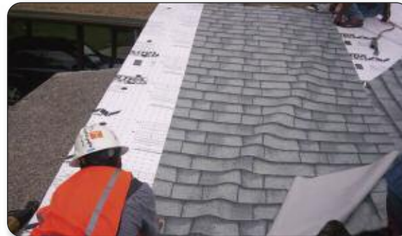
Easily installed by authorized Duro-Last contractors.

The Shingle-Ply roofing system is protected by the best warranty in the roofing industry. Our standard, comprehensive 15-year commercial warranty is transferable, has no exclusions for ponding water, and provides coverage against consequential damages that result from defects in the Duro-Last material and/or installation workmanship. Duro-Last also has 20-year limited warranties available.